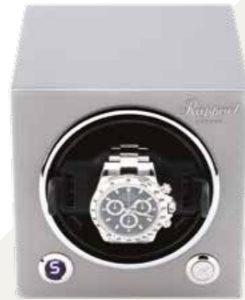
EVO45 Platinum Silver