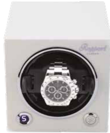
EVO41 Polar White