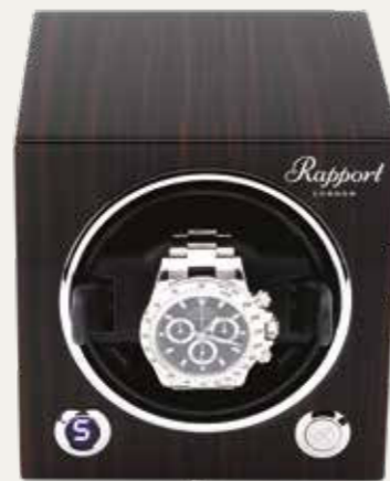
EVO51 Macassar Wood