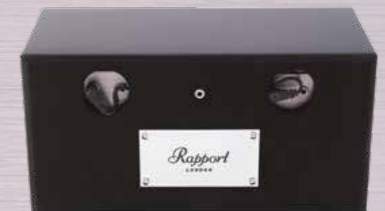
evo Double box MKIII REAR VIEW

FRO52 - Box to take Two Single Watch Winders