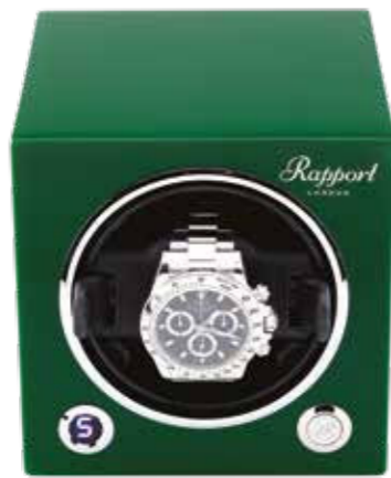
EVO44 Racing Green