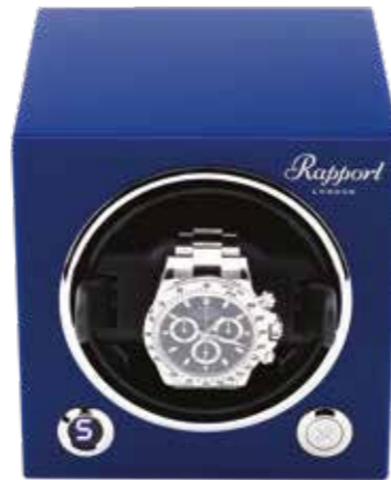
EVO42 Admiral Blue