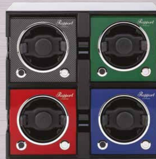
evo Quad box MKIII SIZE: 280 X 280 X 150MM

Also available are double and quad cases, constructed in gloss finish Ebony, into which you can slot individual evocube MKIII watch winders in any combination of colours you desire. Each compartment is lined with leather to allow a snug, scratch-proof fit of the units. These cases are wired to allow operation of all winders with a single electric adapter.