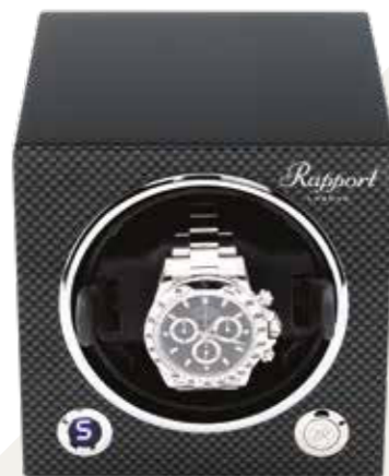
EVO50 Carbon Fibre