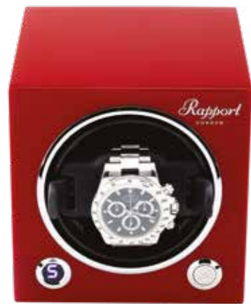
EVO43 Crimson Red