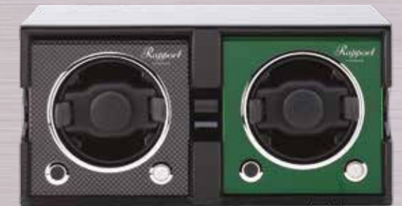
evo Double box MKIII SIZE: 140 X 280 X 150MM

FRO54 - Box to take Four Single Watch Winders