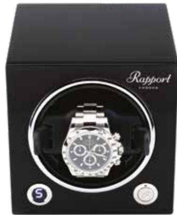
EVO40 Midnight Black

A NEW GENERATION OF ELECTRONIC WINDERS FOR PRESTIGE AUTOMATIC WATCHES SIZE: 120 X 120 X 146MM